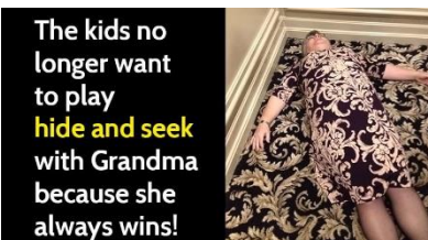
The kids no longer want to play hide and seek with Grandma because she always wins!